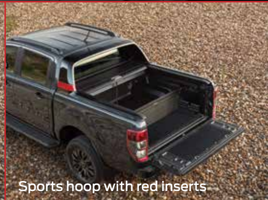
Sports hoop with red inserts

RANGER THUNDER IS ONLY AVAILABLE IN THE FOLLOWING COLOURS: