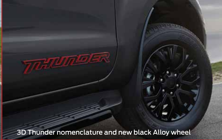
3D Thunder nomenclature and new black Alloy wheel