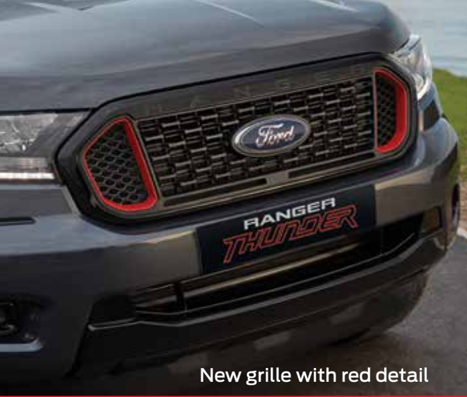
New grille with red detail