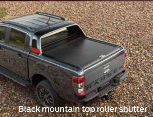
Black mountain top roller shutter